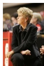
2005 Kay Yow