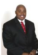
2007 Sidney Lowe