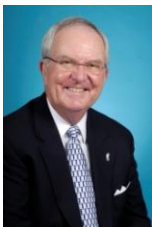
2010 Woody Durham