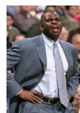
2004 Nate McMillian