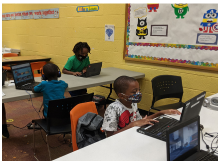
Raleigh Boys Club Virtual Learning