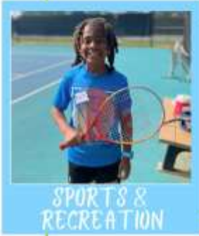
SPORTS & RECREATION

Our members stay active by participating in a variety of sports leagues and daily physical activities!